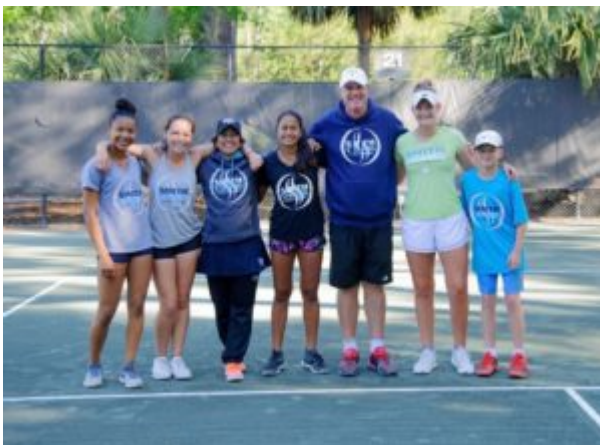
Some of Savie's best memories at the Academy